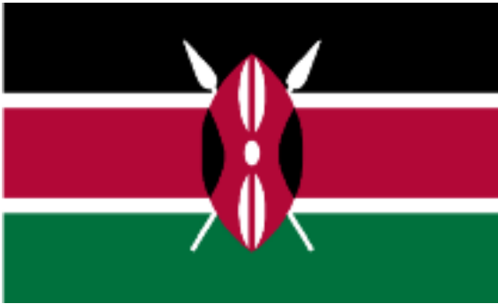
The Kenyan flag, left, and below the flag of Colonial Kenya.