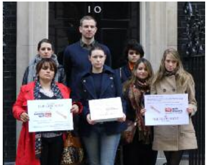
Anti-Slavery International campaigners outside the British Prime Minister's residence to hand in our trafficking petition.

We would like to say a massive thank you to all Anti-Slavery supporters for your incredible help in achieving greater protection for those who suffer at the hands of traffickers. We couldn't have done it without all your fantastic support so please stick with us and keep campaigning!